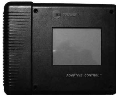
Figure 1 - DynaView operator interface